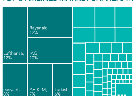
INTRA-EUROPE TOP 6 AIRLINES MARKET SHARE: 54%