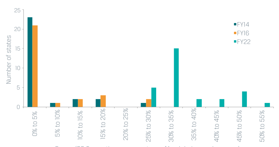
EXHIBIT 1. RE AS A % OF LOAD FOR DIFFERENT STATES (2014, 2016 AND 2022)

Until now, share of RE generation as a percentage of load has been low in most states. With aggressive capacity addition targets, by FY22 (green bar graph in Exhibit 1 below), that RE generation is estimated at more than 25% of load during peak RE seasons in all states. In FY14, only one state (Tamil Nadu) and in FY16 only two states (Tamil Nadu and Rajasthan) had similar ratios. As the ratio of RE generation to load increases, the risk of curtailment also increases substantially.