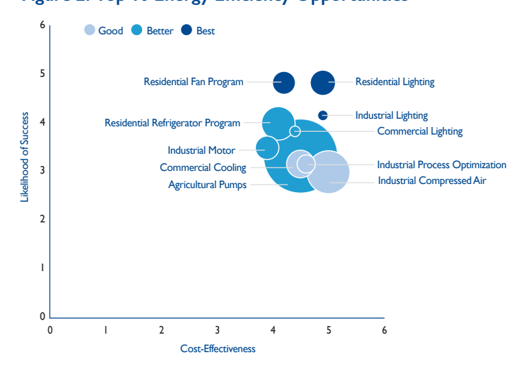
Figure 2: Top 10 Energy Efficiency Opportunities

Figure 2, below, shows the likelihood of success for the 10 most cost-effective opportunities in Telangana and the associated impact potential. Residential Lighting, Residential Fan, and Industrial Lighting are recommended as the Best programs to implement in the near-term, based on likelihood of success. However, other factors can be considered to reprioritize opportunities, since all offer cost-effective savings. Across the top 10 opportunities, the combined 33,257 GWh of potential savings represent 42% of projected total electricity consumption in Telangana in 2018 . This is equal to 30 million tons of greenhouse gas (GHG) emissions reduction.